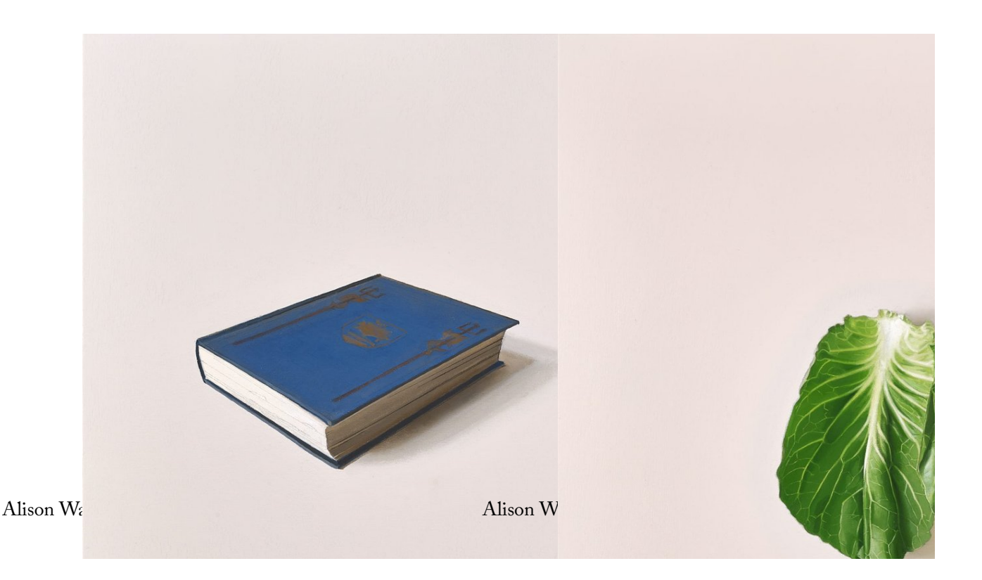
Further inconsistencies are revealed when taking a closer look at the overall exhibition picture. Here, natural light is invited in by the room's large windows to dance upon the canvases. Yet, looking around the room, one will notice that the light from the window does not always match the depiction of light hitting the painted objects. On one wall, where Temple (2021) is hung, the 11:00 morning light creates a realistic shadow. At the opposite end of the room, the shadow second skull Memento (2021) falls towards the light. The effect is

Amidst the sea of neutral pastels and muted tones, deep turquoise blue and bright garden green are easy to pick out. Found in Fox (2019) and Frances (2022), respectively, these pops of colour add the perfect touch needed to spice up a viewer's visual palette. The former - a hardback book adorned with gold details - is a detail lifted from his Portrait of Caroline Fox, 1st Baroness Holland (1766). However, whilst this portrait depicts two books stacked askew on the side table next to the sitter, there is no exact copy of the book, which is shown in Watt's picture. Likewise, the cabbage references Ramsay's Franny Boscowen (c. 1748), whose portrait features a plethora of flora sitting in her breast and cabbage and hazelnuts in her hand, gesturing towards her passion for gardening. In both cases, Watt skillfully lifted these details from their original portraits and made them her own by adding her own inconsistencies in scale, the presence of shadows and the addition or omission of other small details.